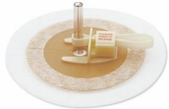
Hollister Vertical Dressing