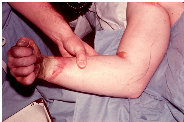
Figure 1. Kissing Burn 3

(Reprinted by permission from Elsevier. This figure was published in Rosen's Emergency Medicine Concepts and Clinical Practice, Price TG and Cooper MA, Electrical and lightning injuries, 2267-2278, Copyright © Elsevier 2006.)