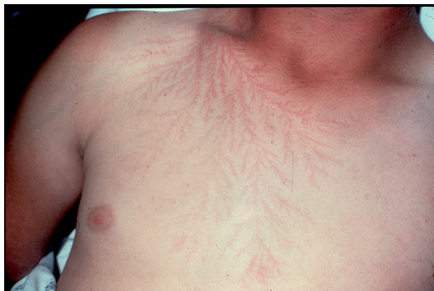
Figure 2. Feathering Burn

(Reprinted by permission from Elsevier. This figure was published in Rosen's Emergency Medicine Concepts and Clinical Practice, Price TG and Cooper MA, Electrical and lightning injuries, 2267-2278, Copyright © Elsevier 2006.)